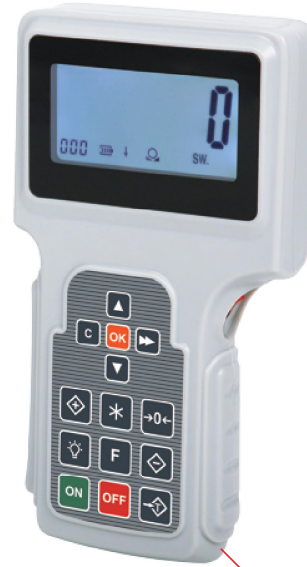
LCD remote controller (included)