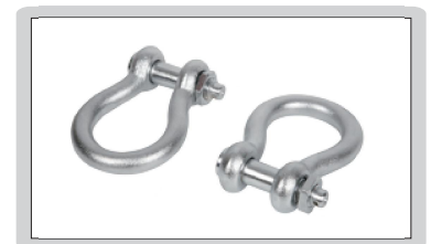
hang scale pull rings (optional)